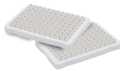
/// Equipped with tube adaptors